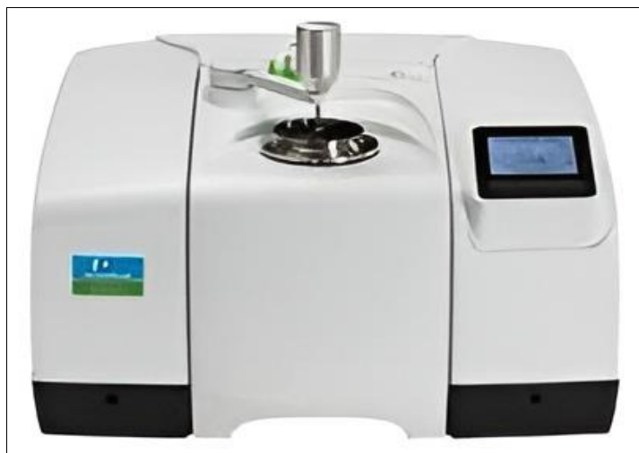
Fig 1: PerkinElmer FT-IR System

Fourier-transform infrared (FT-IR) spectra of ibuprofen were obtained using IR spectrophotometer (PerkinElmer FT-IR System, Spectrum BX, Perkin-Elmer, UK). The samples were scanned over the wave number range from 4000 to 550 \text{cm}^{-1} .